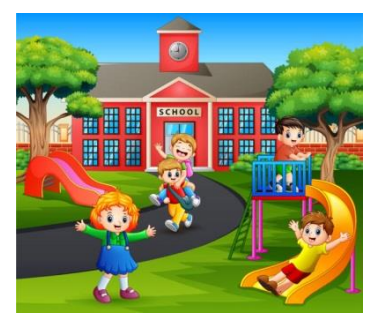
Field, Garden & School Yard

Scoil Naomh Áine operates a recycling system and pupils are very much involved in this. We are a Green Flag School and proud of it. The children take great pride in keeping their school, classrooms and the grounds tidy and litter free. Children are required to bring a lunch box and take home unwanted lunch leftovers. Fruit waste, such as banana peels, is recycled in our special composting bins.